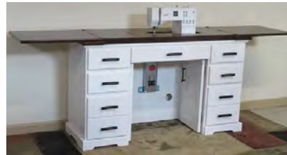
Sewing Machine Cabinets