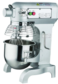
Omcan 10 quart Mixer