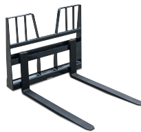
Pallet Fork 4,000 lbs