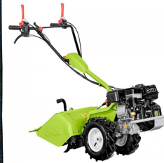
Grillo G52 19"