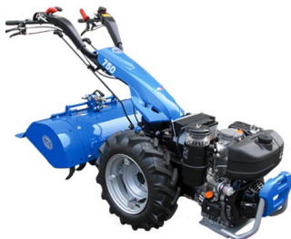
BCS 852 Tiller