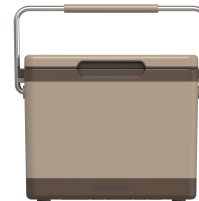
Verge 20 Qt Lunch Box