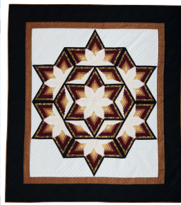
Diamond Blending Star Quilt

To Support the Clinic for Special Children ®