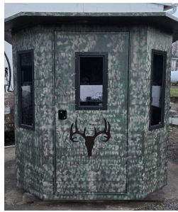
2 Hunting Blinds