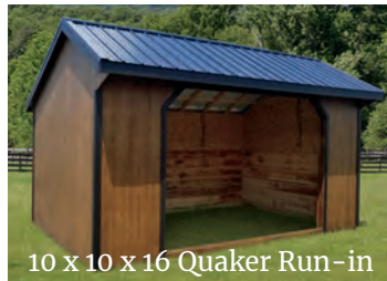
10 x 10 x 16 Quaker Run-in