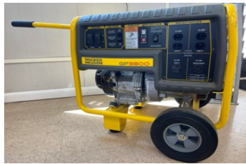
Wacker Neuson GP3800