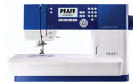
Pfaff Sewing Machine