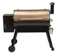
Traeger Pro Wood Pellet