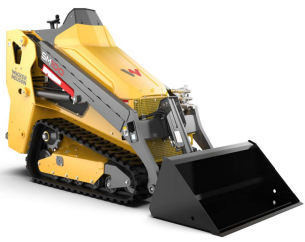
Wacker Neuson SM60 26.5 HP

6:30 AM Breakfast | 8:30 AM Auction Begins | 9:45 Theme Baskets | 11:00 AM Remarks by CSC Doctors & Staff 12:00 Quilts | 12:00 Carriages | Lawn Furniture | Household Furniture | Silent Auction Ends 1:00 | 1:15 Toys