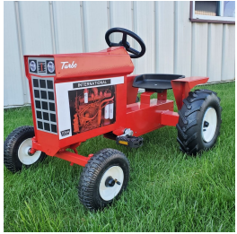
IH 1066 Pedal Tractor