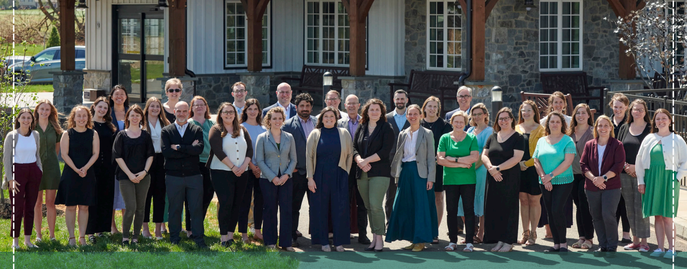
Staff Photo | May 2025