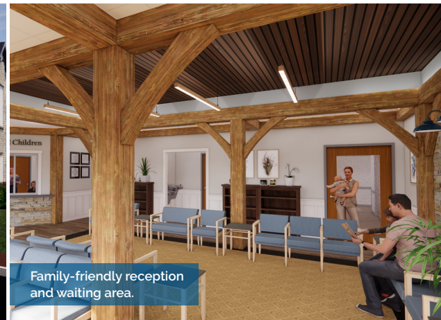
Family-friendly reception and waiting area.