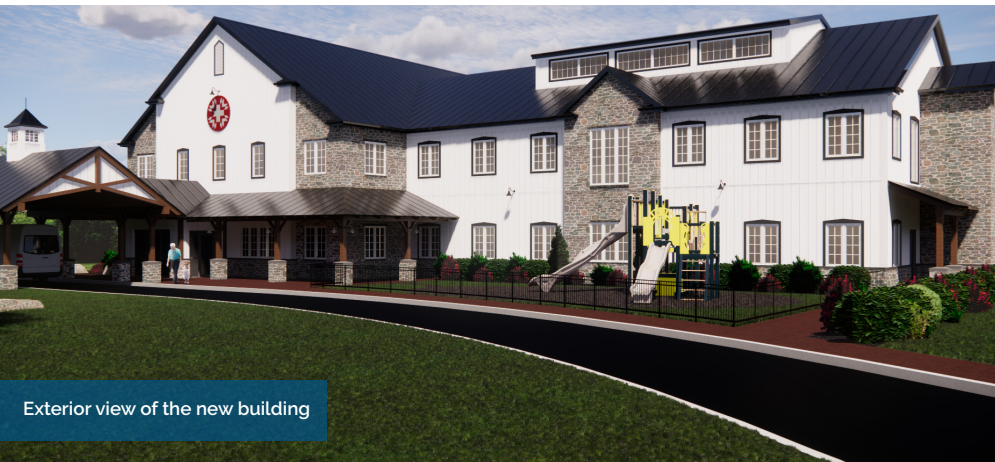
Exterior view of the new building

The assortment of renderings below show how we hope various areas in the new building will look. We're excited to share these updates with you as the project becomes a reality.