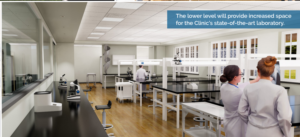
The lower level will provide increased space for the Clinic's state-of-the-art laboratory.