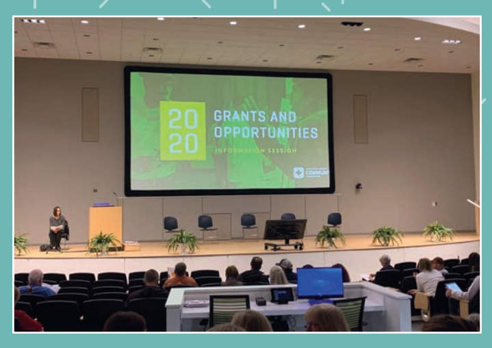
CSC staff members attended the Lancaster County Community Foundation's annual 'Grants and Opportunities' meeting in March.