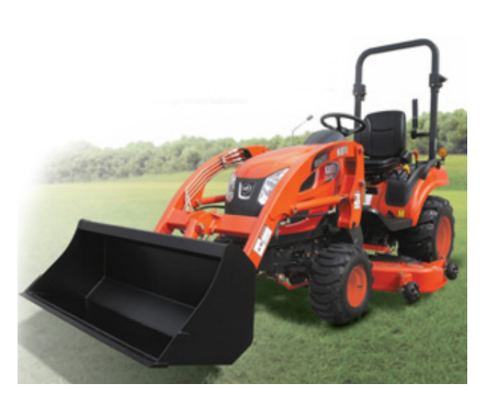
Kioti CS2210 Tractor with Mower and Loader

7:00 AM Breakfast | 8:30 AM Auction Begins | 11:00 AM Remarks by CSC Doctors | 12:00 PM Quilts