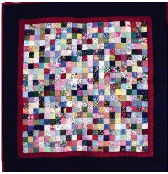
POSTAGE STAMP QUILT