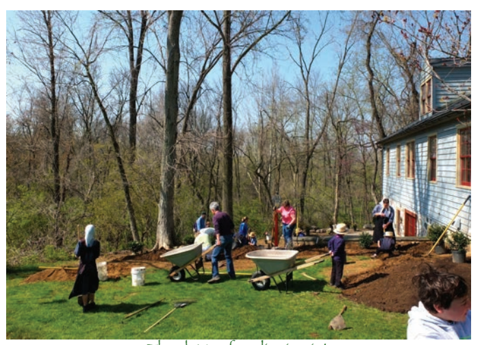
Thank You for digging in!

1:00PM - 5:00PM - Garden cleanup, weeding, planting, and mulching. Volunteers can RSVP to the Clinic at 717 687-9407.