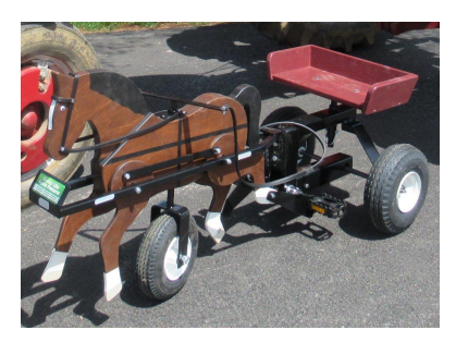
Wooden Horse Tricycle