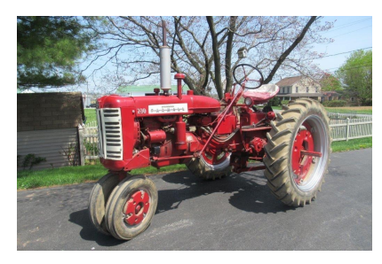
1959 Farmall 230 Fast Hitch with 2 Bottom Plow